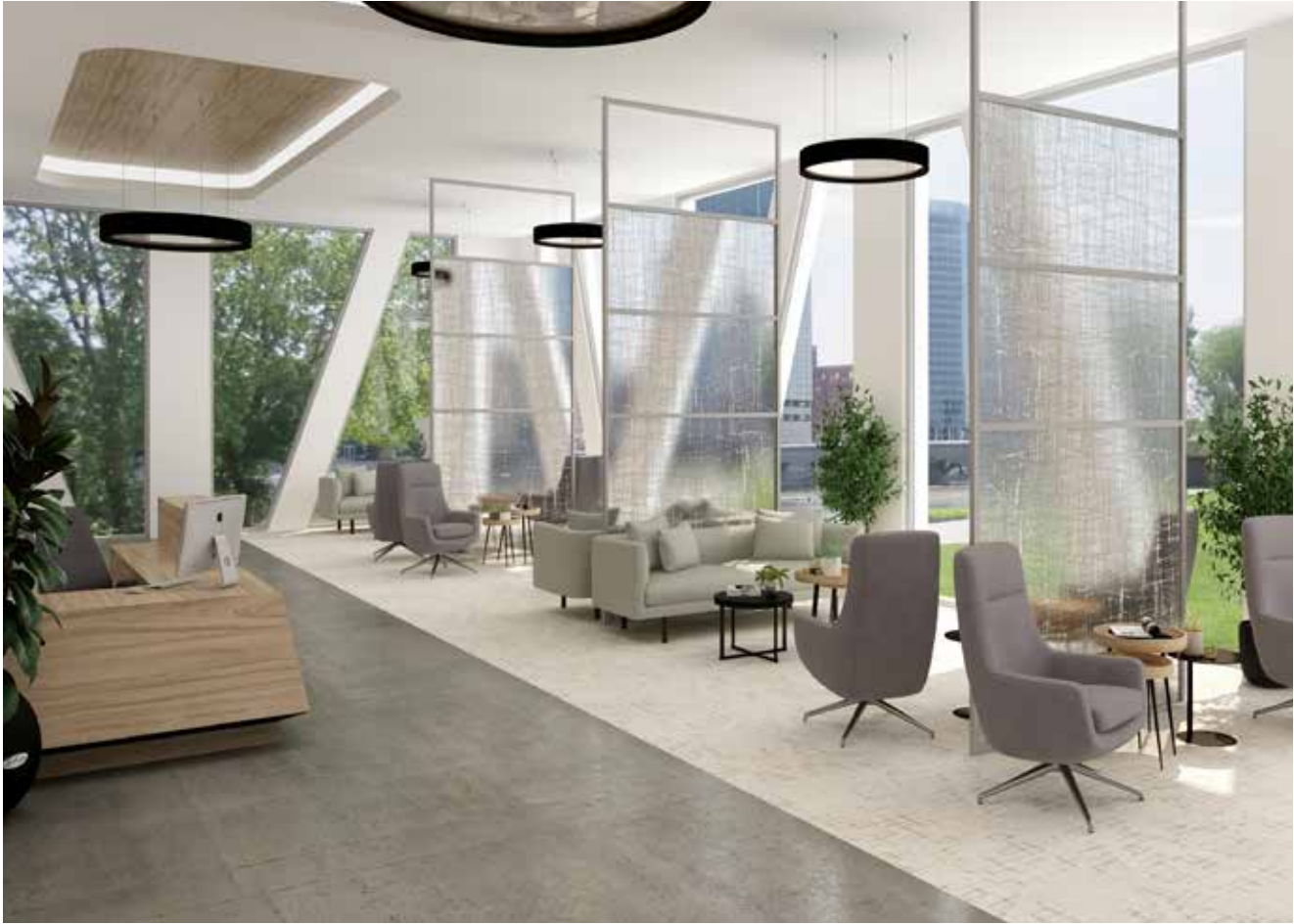
Intersection Panels with Custom Decorative Glass Inserts and Custom Color Powder Coat Frames.