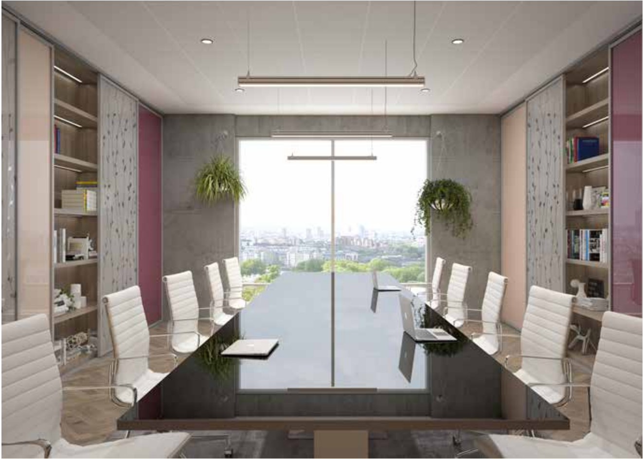
Intersection Slide with Custom Color Back Painted Glass Panels and Decorative Glass Panels.