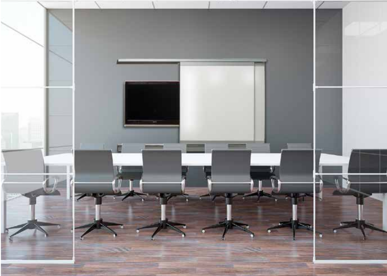
VIP+ Glass Media Walls with Back Painted White Starphire Glass.