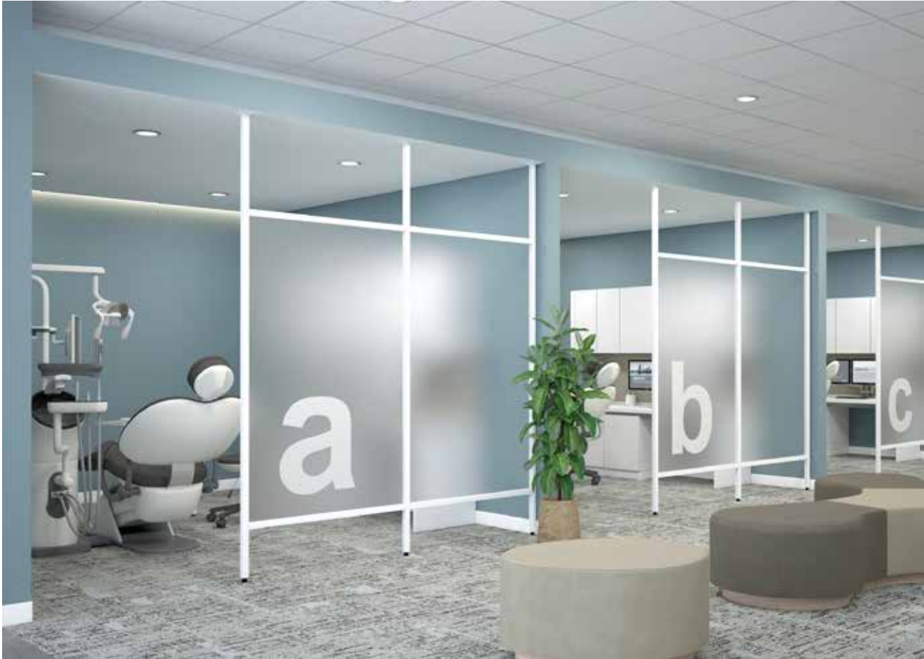
Intersection Panels with Translucent Custom Painted Glass Panels and White Powder Coat Frames.