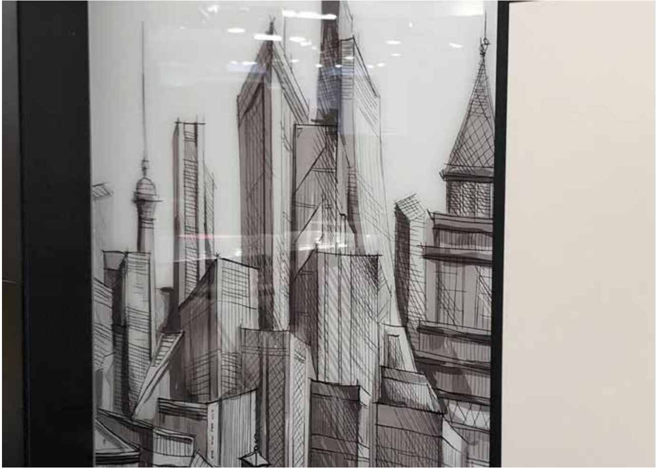
Frameless Back Painted Corona White Glass with Printed Custom Graphics.