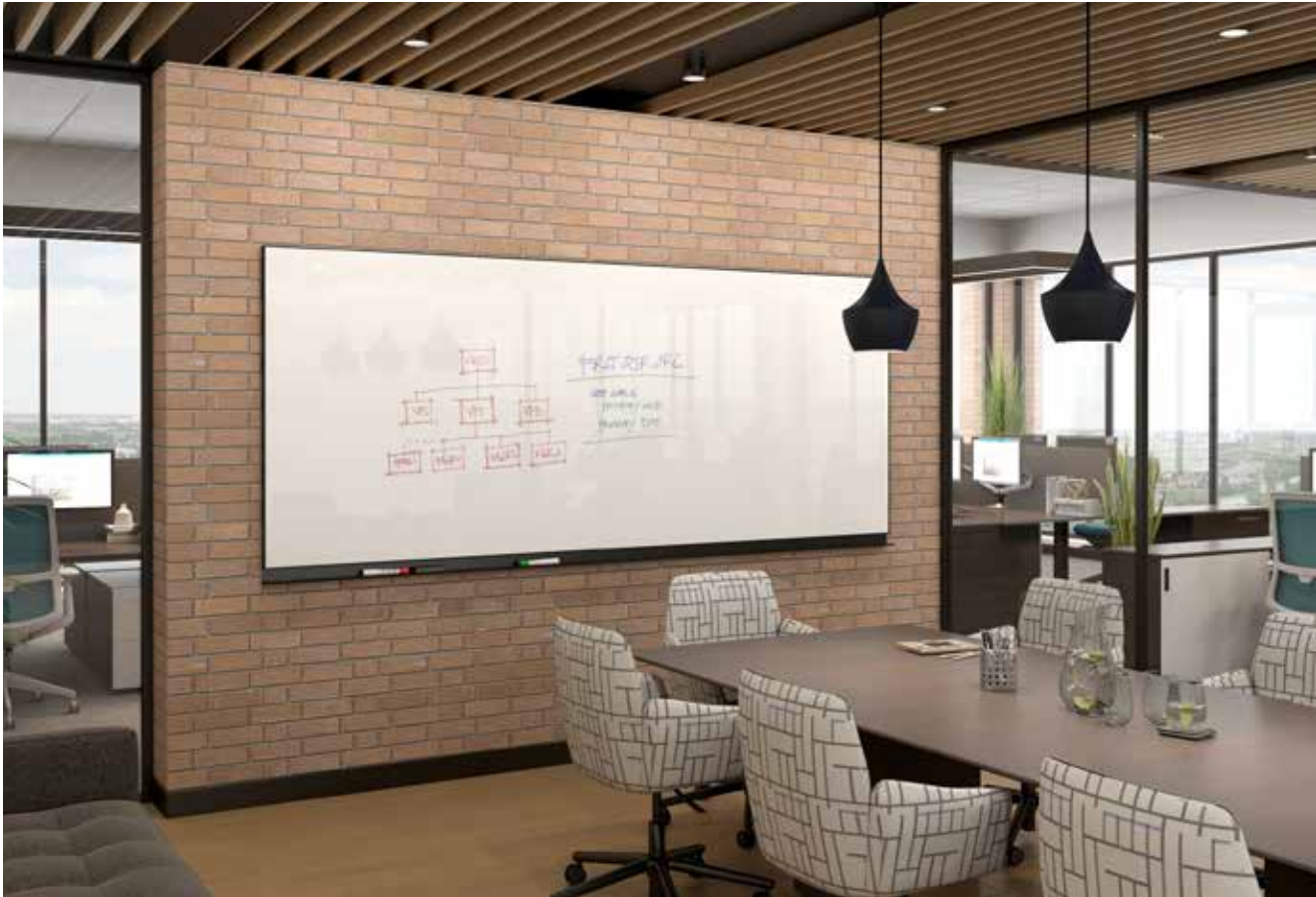
elements Series Framed Glassboards in Classic Starphire and Black Powder Coat Frames with Integrated Penshelf.