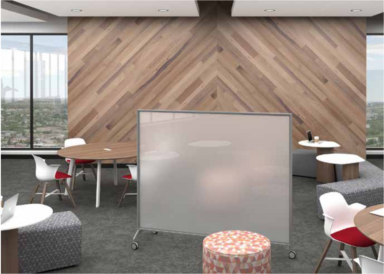
elements Series Tri-Leg Mobile Room Dividers- flexible sizes, almost unlimited colors and glass styles are available.