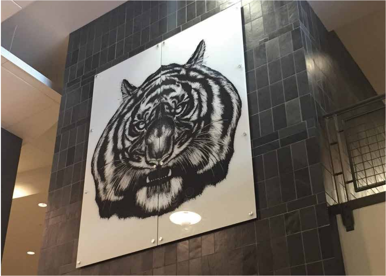
Custom graphics make the Glassboard a design element for any environment.