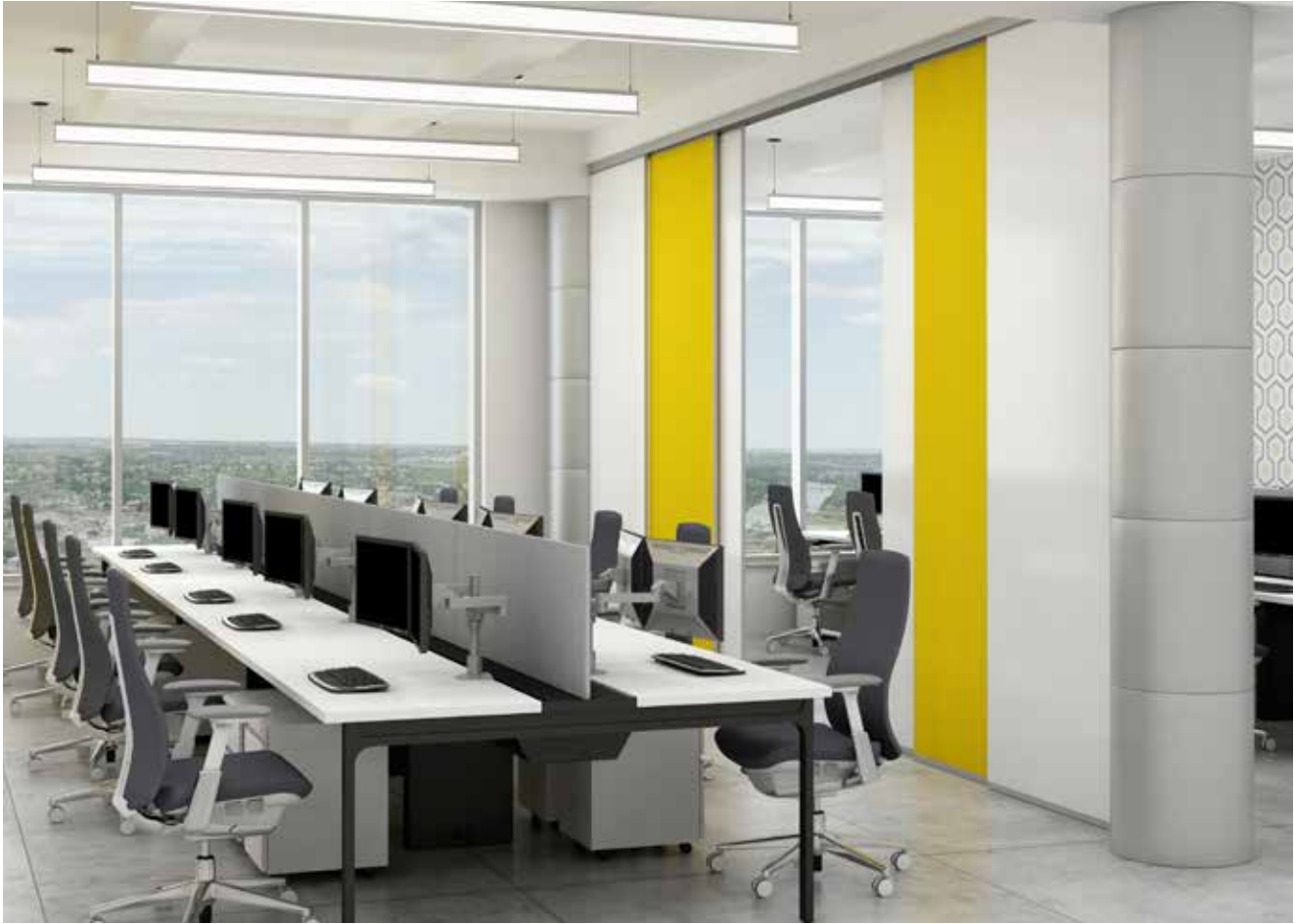
VIP+ Sliding Wall Panels with Back Painted Custom Color Glass Panels.