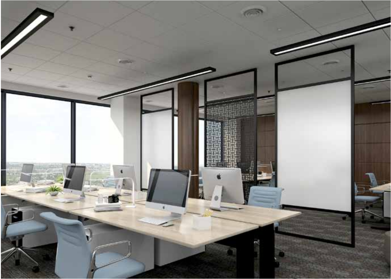
Intersection Panels with Back Painted Satin Non-Glare Glass Panels, Custom Cut-Out Wire Mesh and Black Powder Coat Frames.