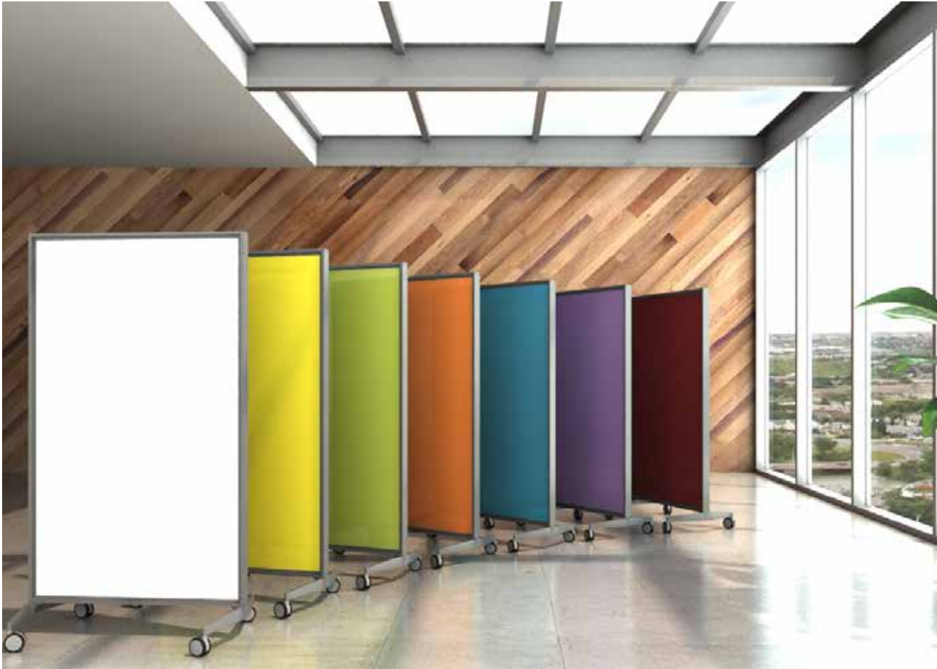
elements Series Mobile Glass Markerboards: Backed Painted Starphire Glass matched to almost any color and of your choice in Black Frames or Anodized Aluminum.