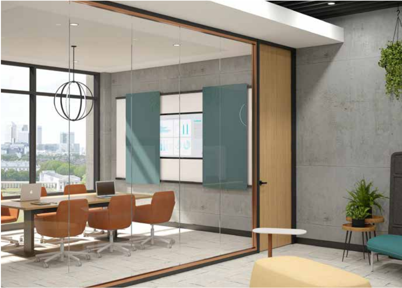
Merge Rail Frameless Glass Media Walls with Sliding Glass Panels and custom cutouts to accommodate recessed technology.