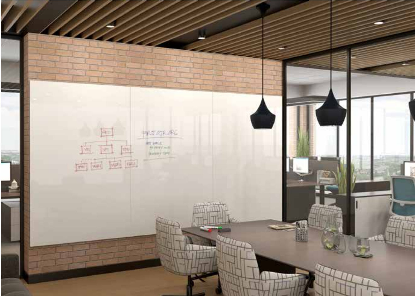
Frameless Glassboards in Classic Starphire