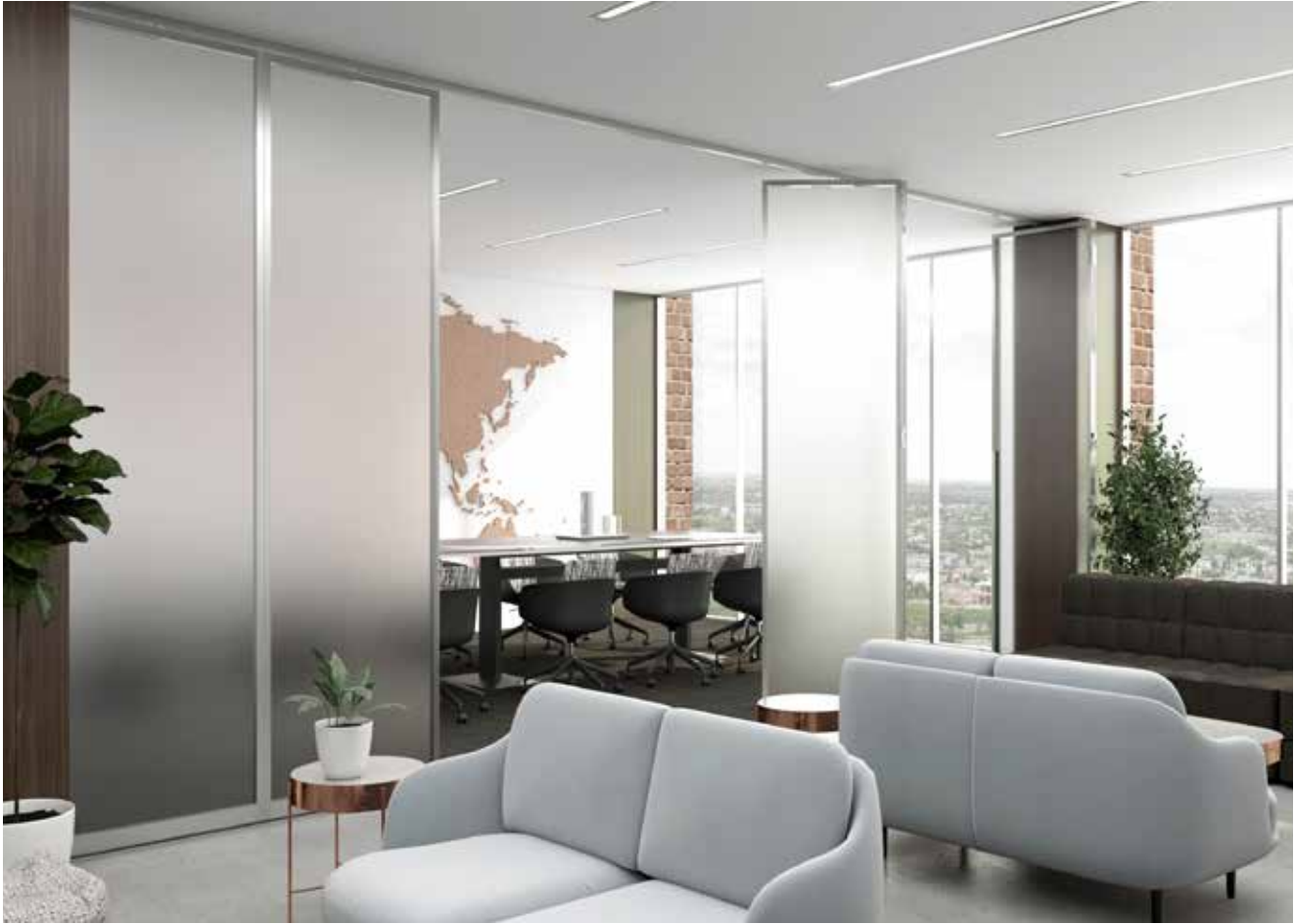
Intersection Stack with Translucent Glass Panels. Also available in Back Painted Glass Panels, Porcelain, Fabric or Acousticor Panels.