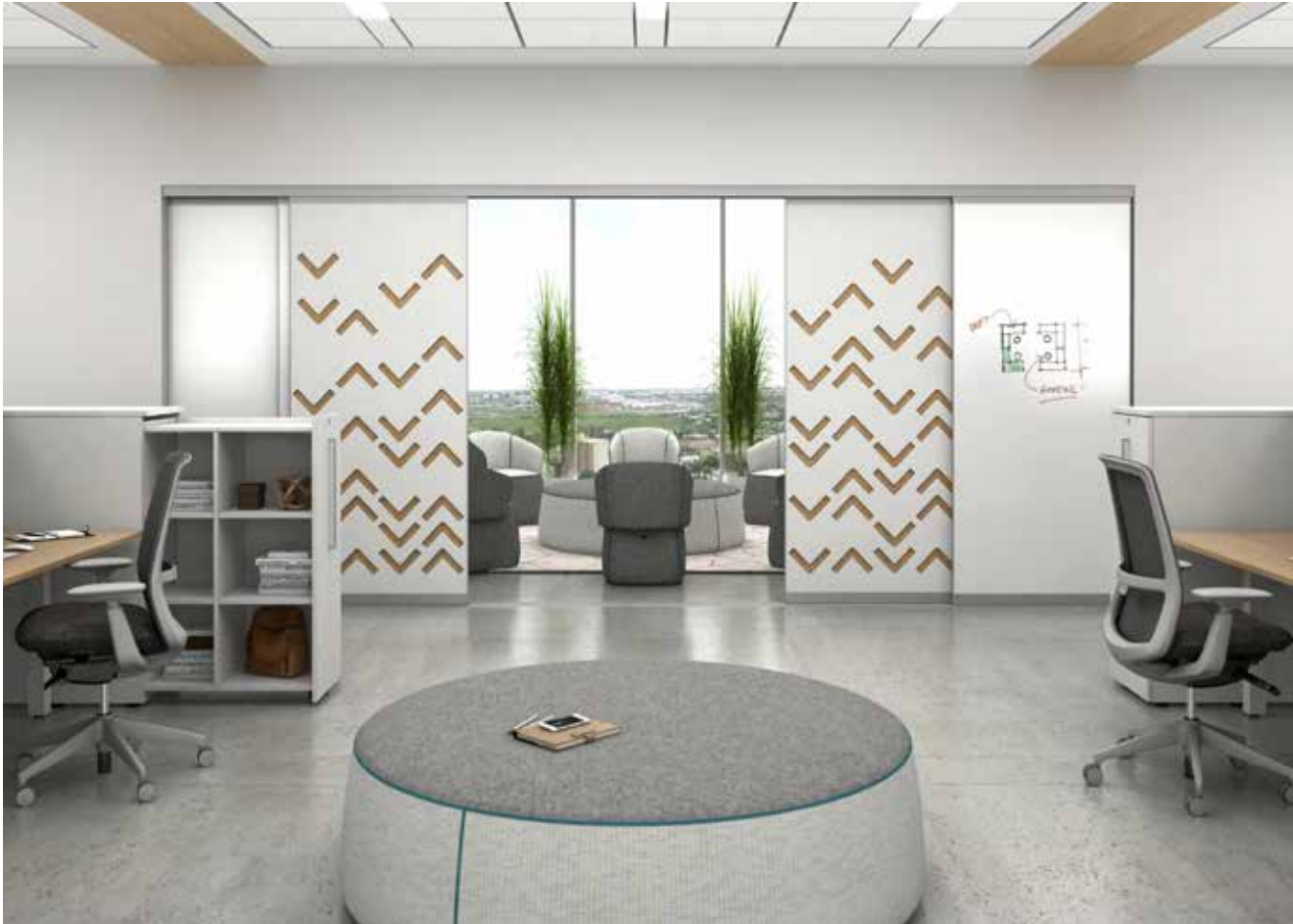
VIP+ Sliding Wall Panels with Translucent Glass Panels with Custom Cut-Out Acoustic Panels.