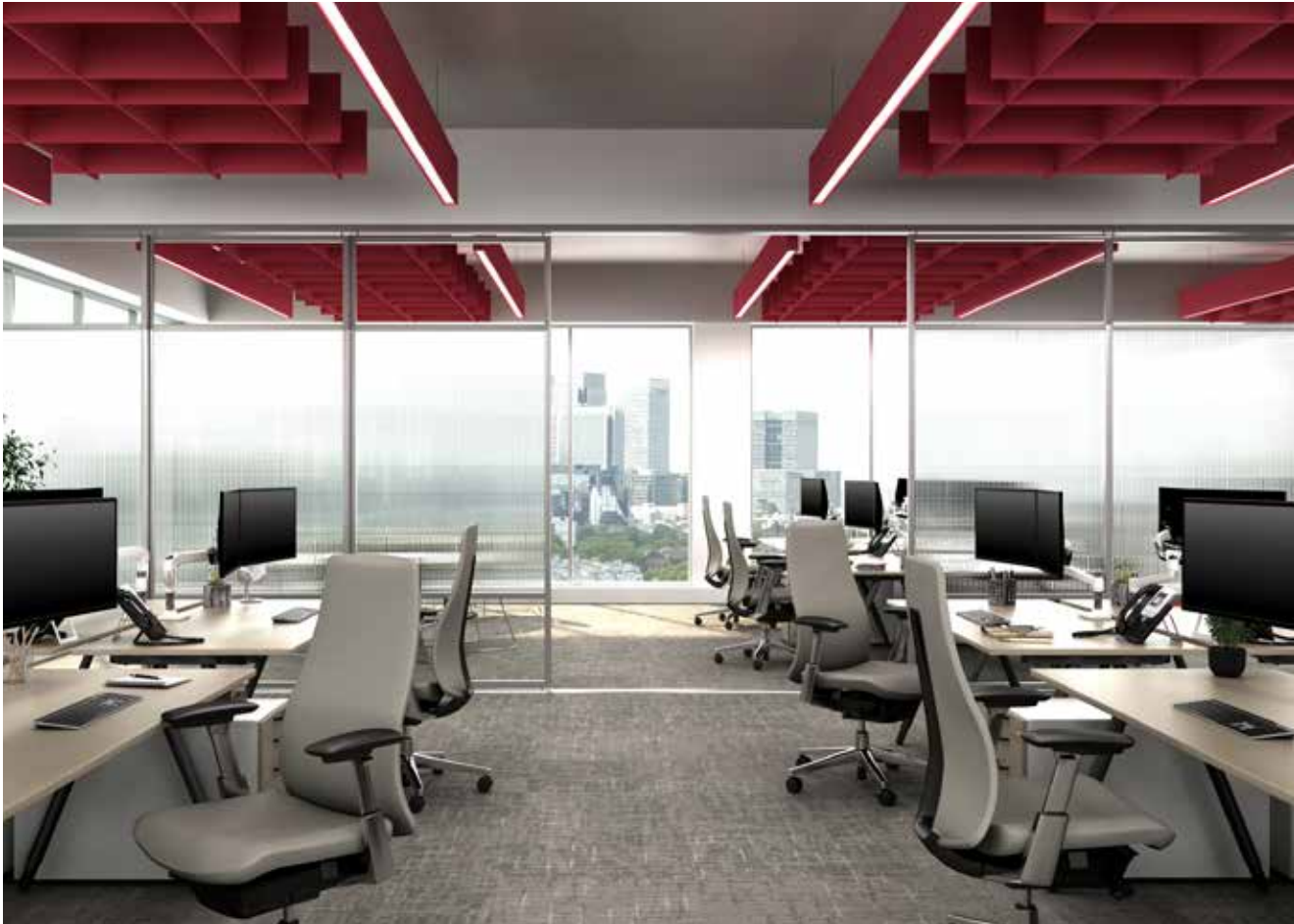
Intersection Sliding Glass Panels with Custom Decorative Glass and Acousticor Acoustic Ceiling Baffles