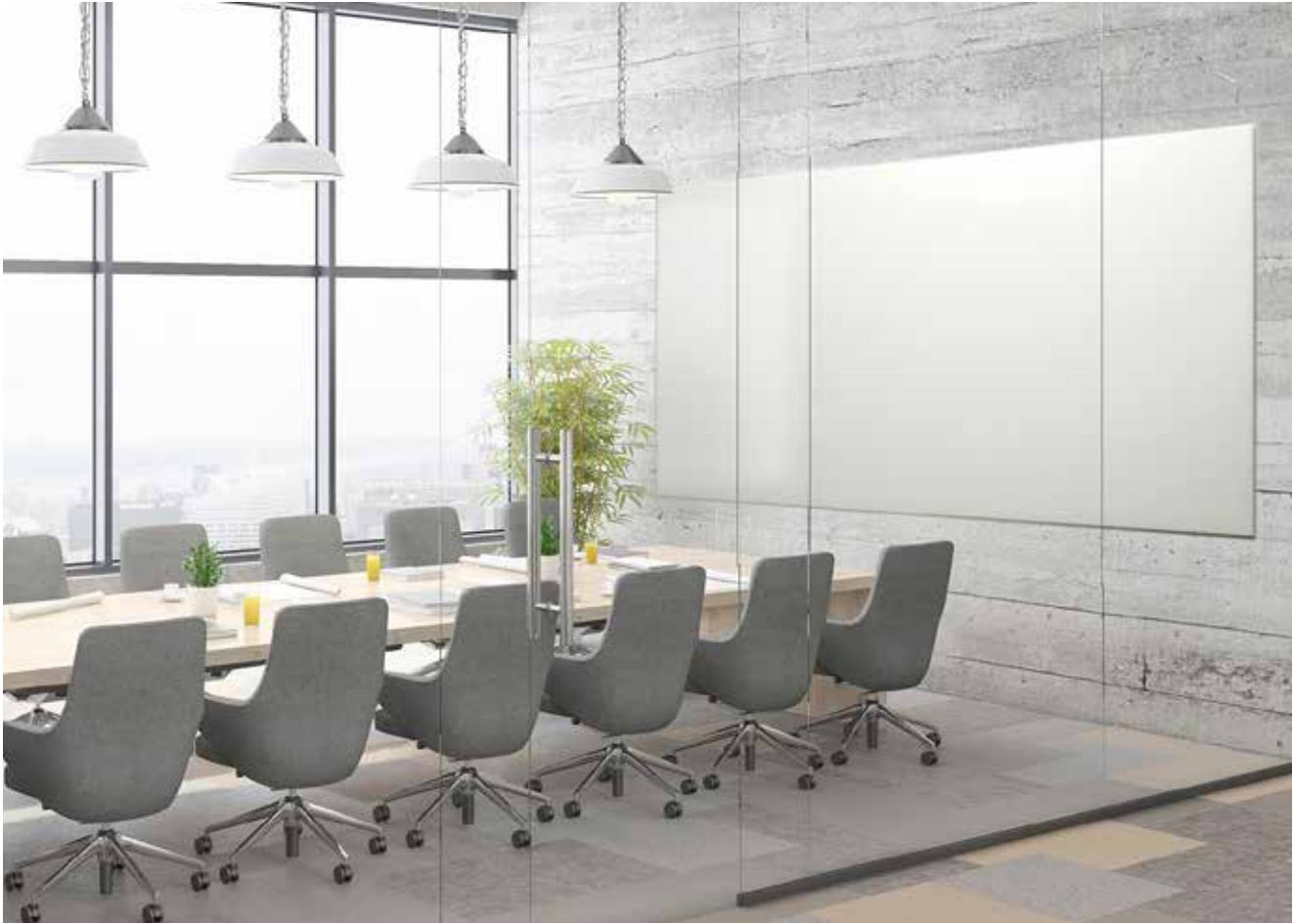
Frameless Markerboards in Satin Non-Glare Glass.