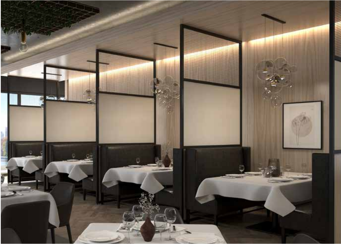
Intersection Panels—a Divider System for open environments, shown here with Custom Metal Mesh and Classic Starphire Back Painted Glass Panels.