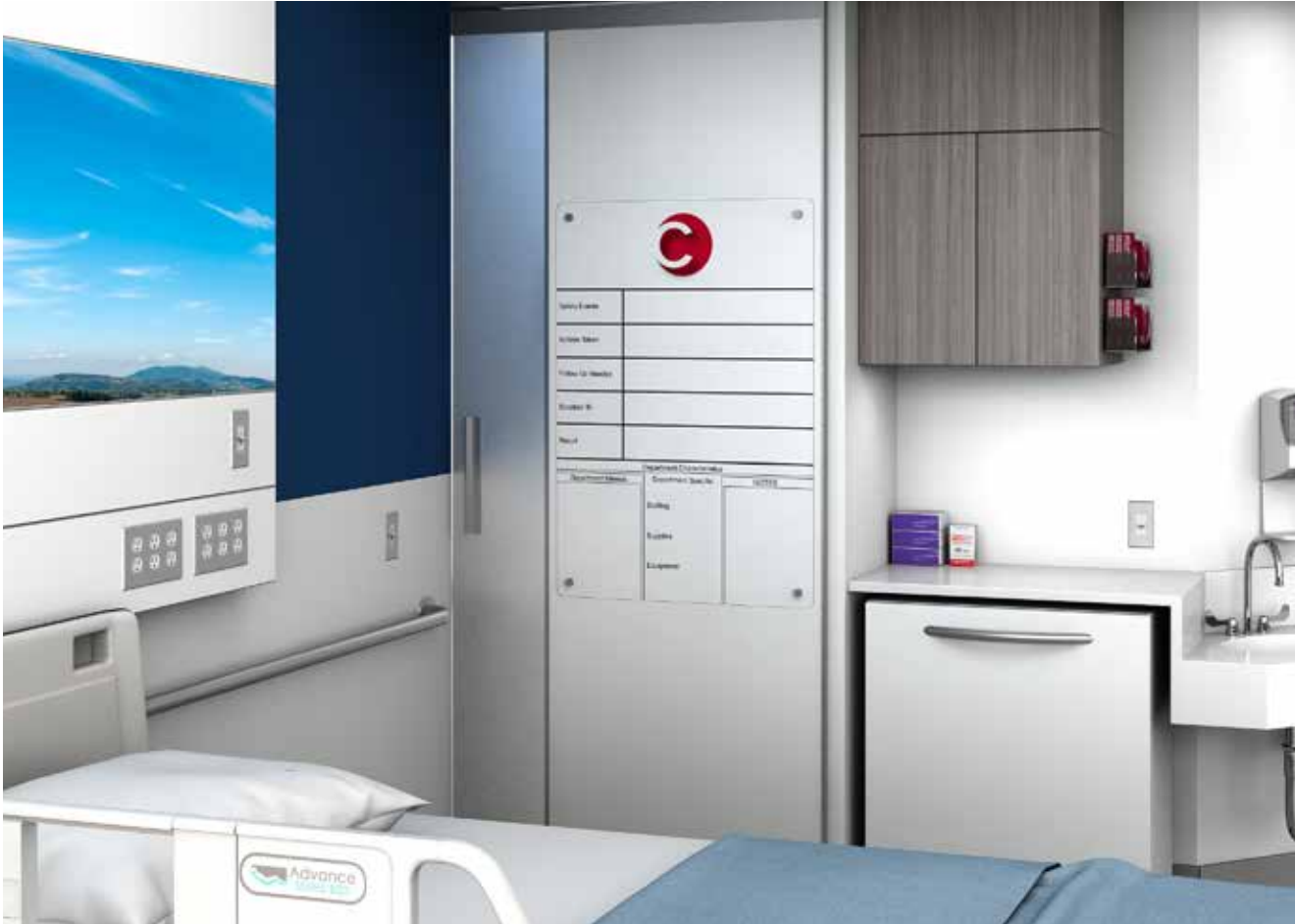
Custom VIP+ Sliding Patient Room Boards for healthcare applications that require high anti-microbial functionality.