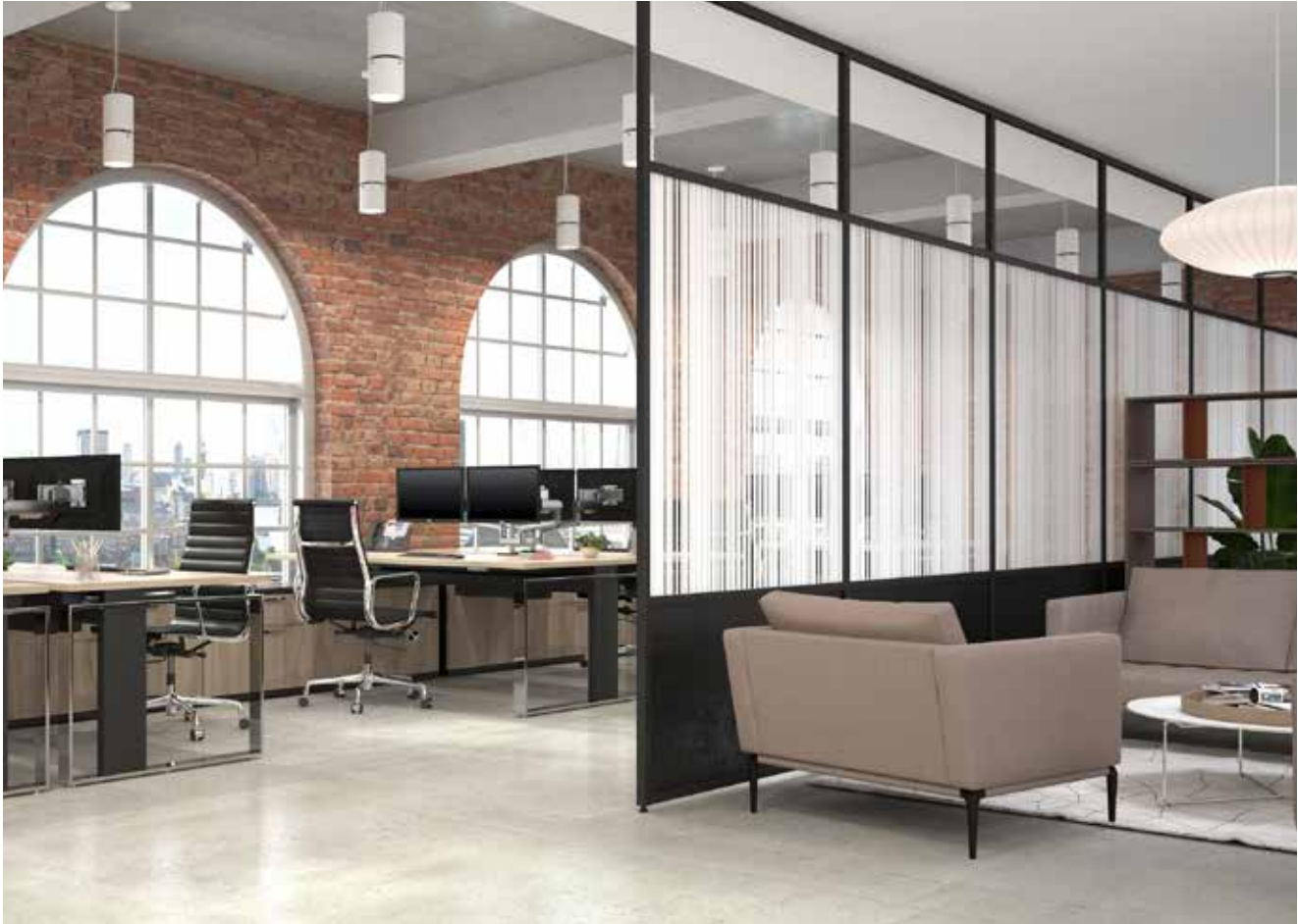
Intersection Panels with Custom Decorative Glass Inserts and Custom Color Powder Coat Frames.