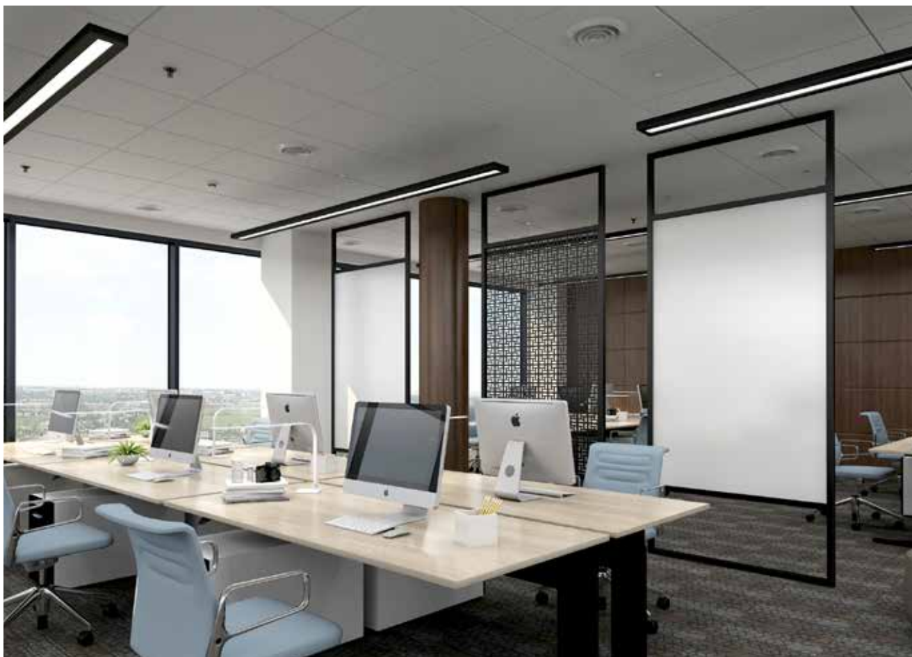
Intersection Panels with Back Painted Satin Non-Glare Glass Panels, Custom Cut-Out Wire Mesh and Black Powder Coat Frames.