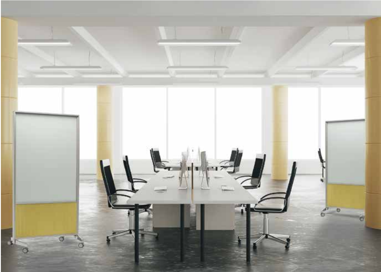
elements Series Mobile CombiBoards with Back Painted Glass Panels, Acoustic Inerts and Anodized Aluminum Frames.